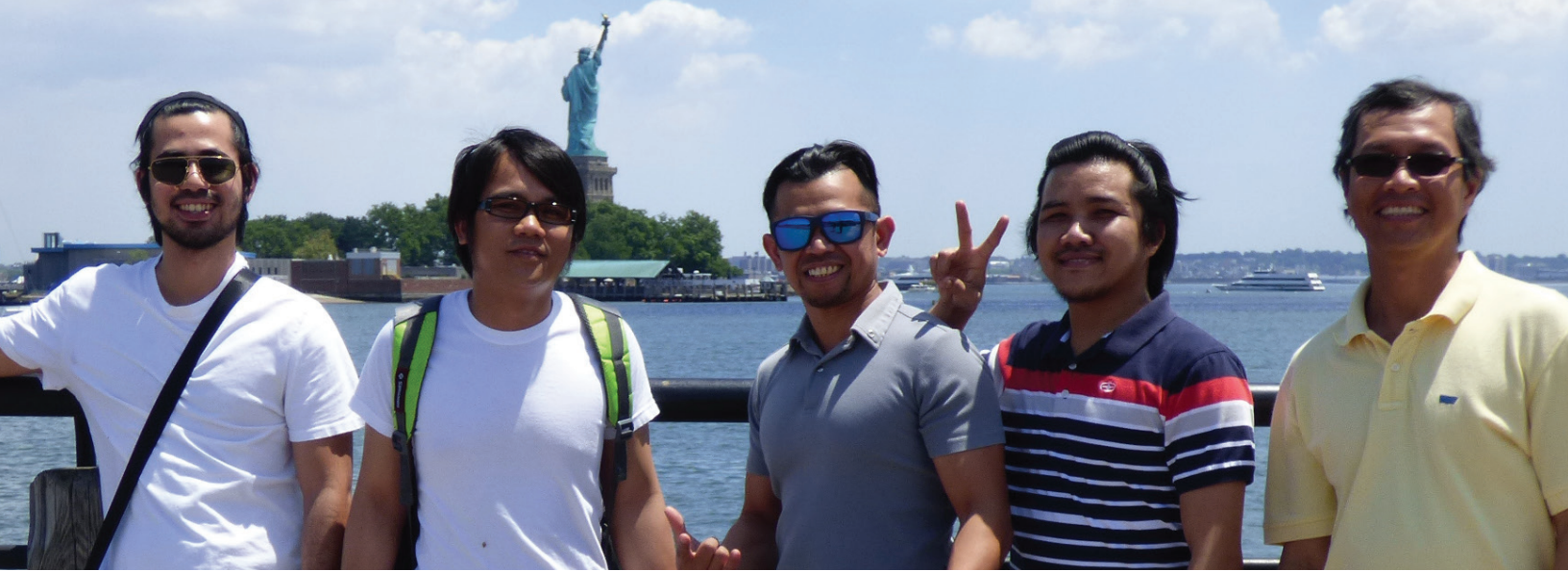
Crew members of the Helsinki Bridge enjoy a trip to Liberty State Park.