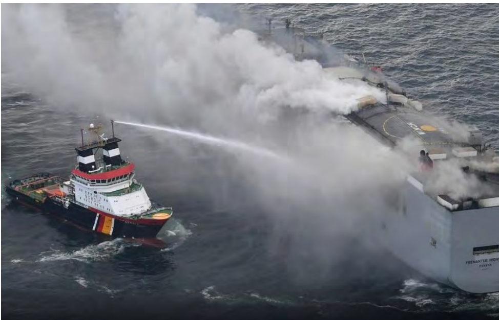
Emergency services tackle the blaze on the Fremantle Highway.