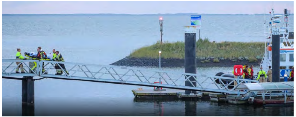
Rarely do we see images of the mariners affected by these disasters. They often remain "unseen" and are hardly mentioned. A seafarer of the Fremantle Highway is rushed to care.