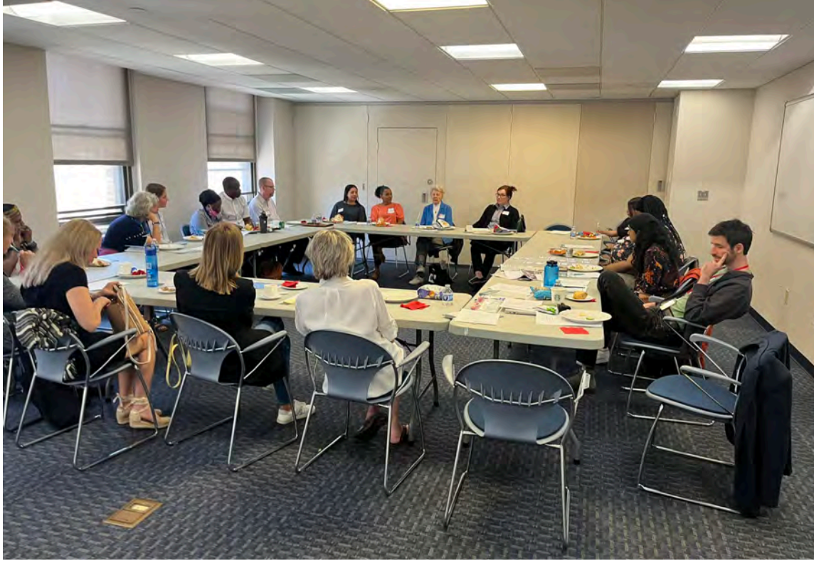
The Immigration Roundtable offers SIH Immigrant Mission Committee members and our immigrant partner organization a forum to assess current needs of migrants in New York City.